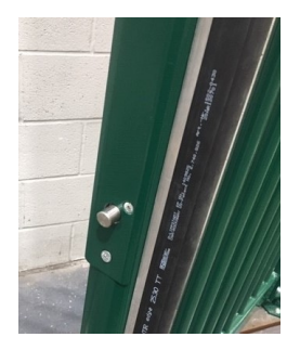
Electric solenoid lock

100% duty cycle heavy industrial usageBS EN 12453 Peace of mind for safetySingle Phase Supply99.9% Access Control compatableFire Alarm Input pre-configured